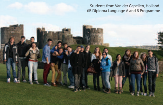
Students from Van der Capellen, Holland. (IB Diploma Language A and B Programme)